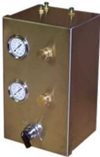
AIR CONTROL BOX